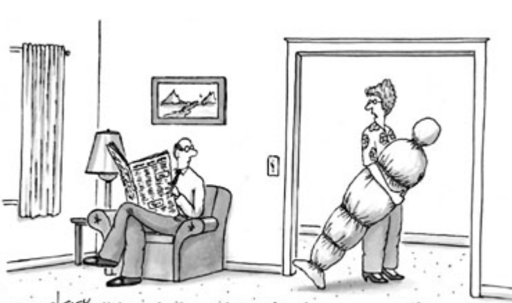
CHEFY "I'm defrosting the basement freezer. Do you still want this?"

• Contraceptives. If she asked for help getting her birth control pills, get a letter proving "solicitation" before you get a criminal record. "Unsolicited samples of an article or thing designed, adapted, or intended for preventing conception is permitted in the mail only when sent to a manufacturer or a dealer of such an article or things, to a licensed physician or surgeon, or to a nurse, pharmacist, druggist, hospital, or clinic (39 USC 3001; 18 USC 1461 )." -> 18USC1461? The post office regulations are citing the wrong law of the land. This citation by the US Postal Service of United States Code1461 in their own postal regulations (it's at the bottom when talking about "preventing conception") suggests some people at the USPS don't see any difference between contraception and abortion. 1461 is about abortion , not contraception . I can't believe lawyers inscribing the law of the land into the federal statute books use language like this: